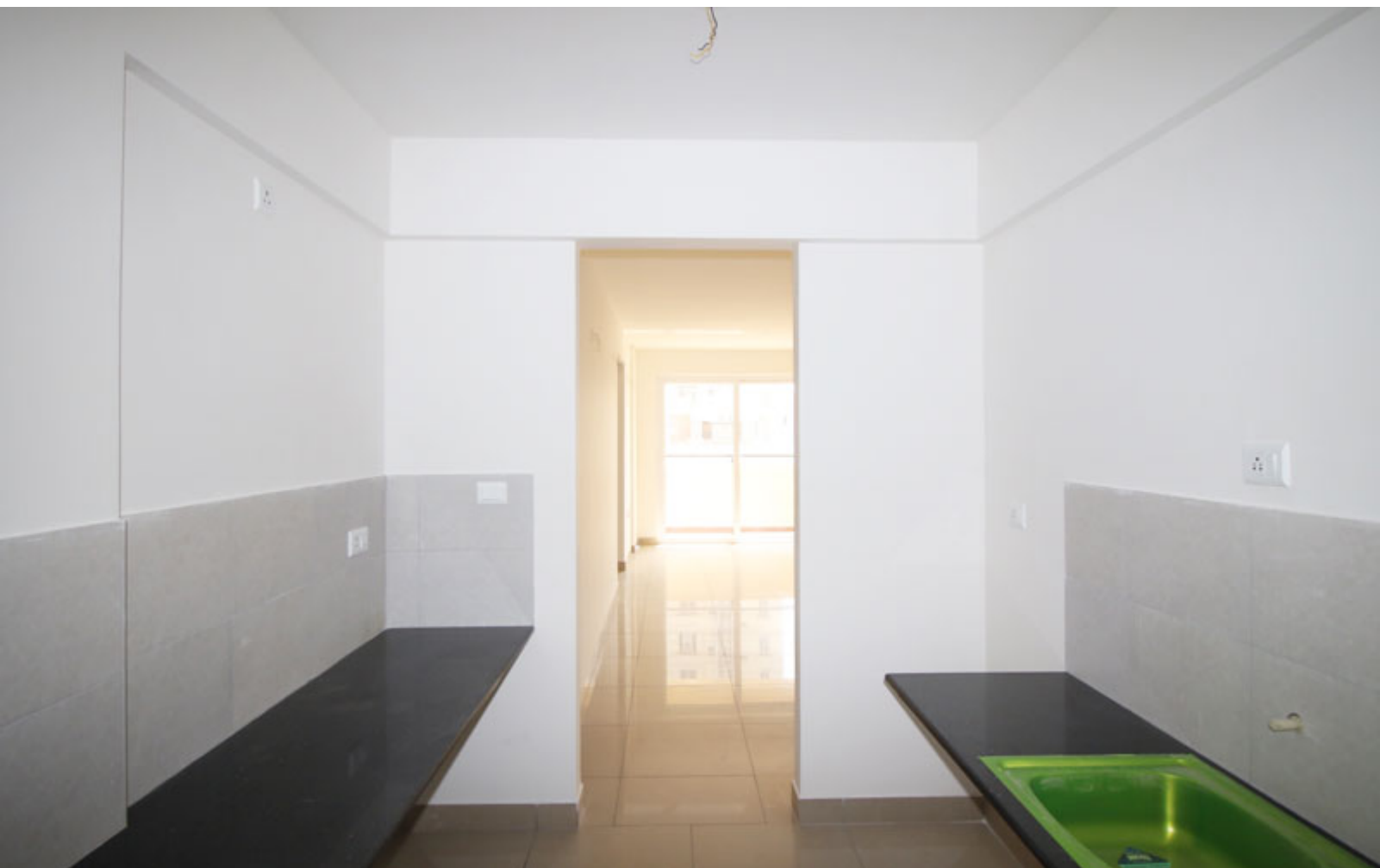
Internal Painting, Plumbing, Electrical work in progress