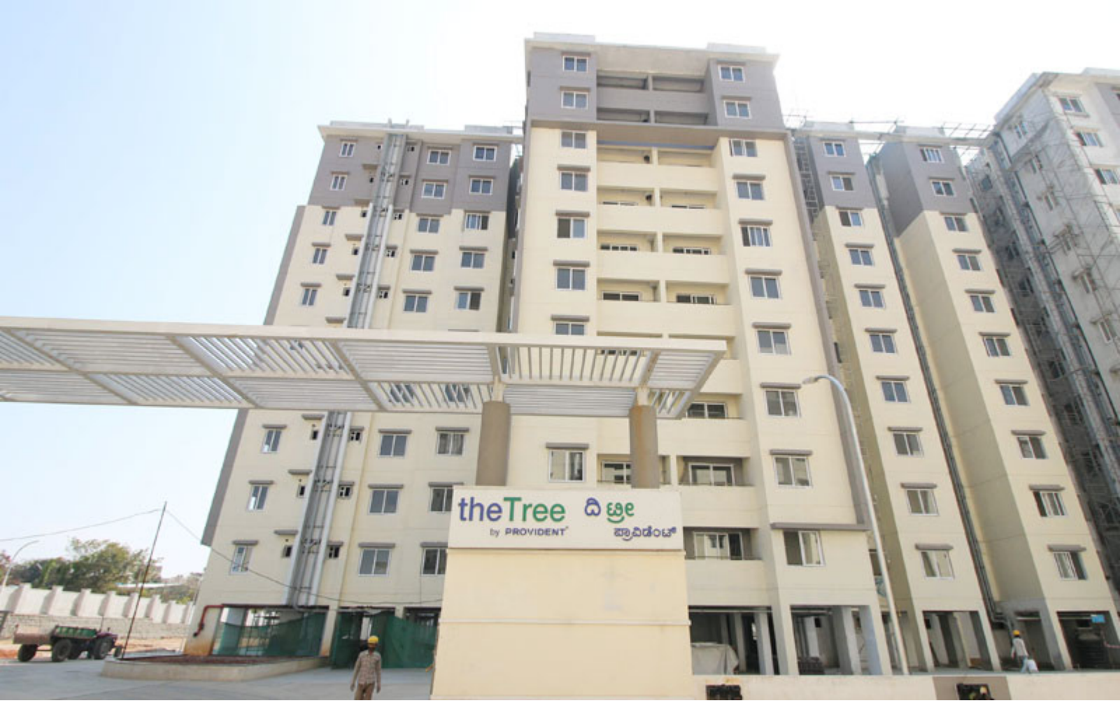
Building 2B - Internal Painting, Plumbing, Electrical work in progress