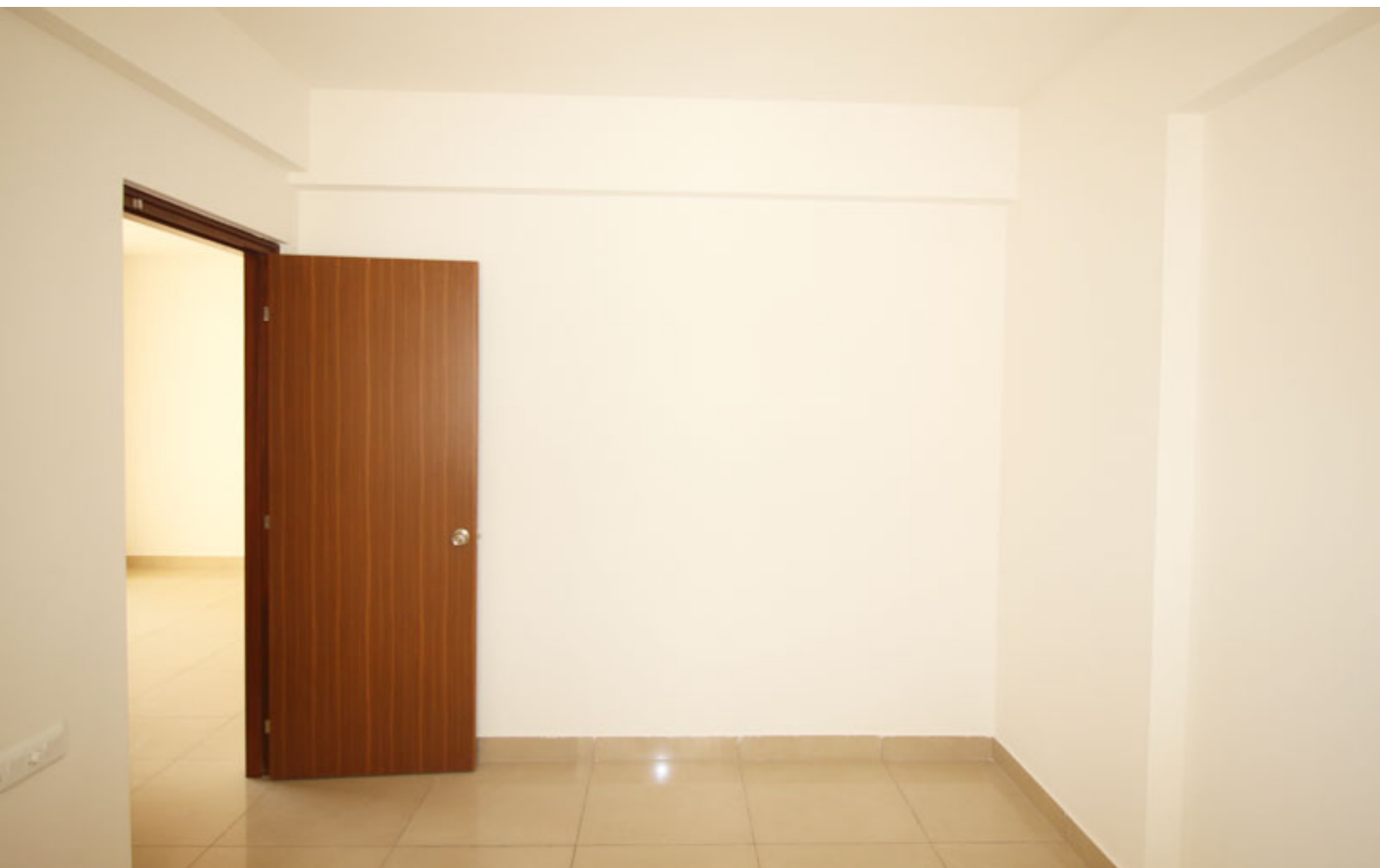
Internal Painting, Plumbing, Electrical work in progress