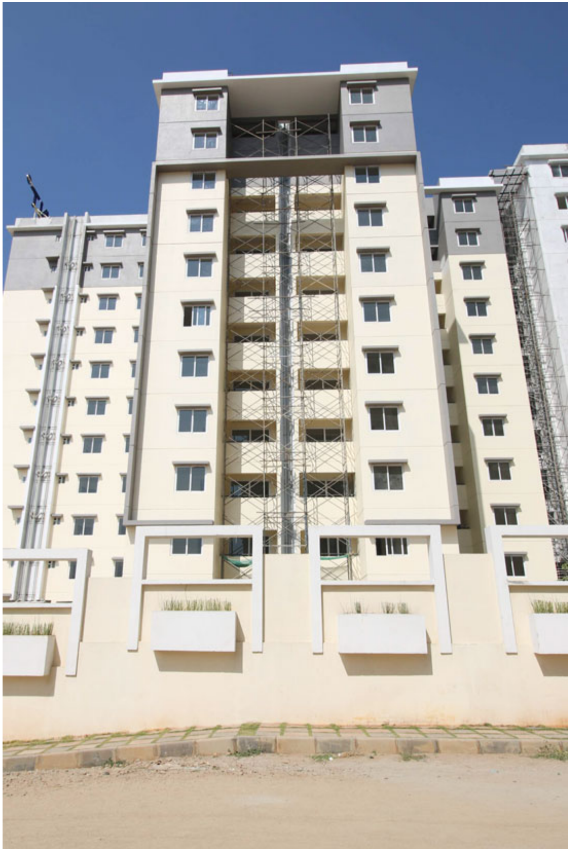
Building 1C - Internal Painting, Plumbing, Electrical work in progress