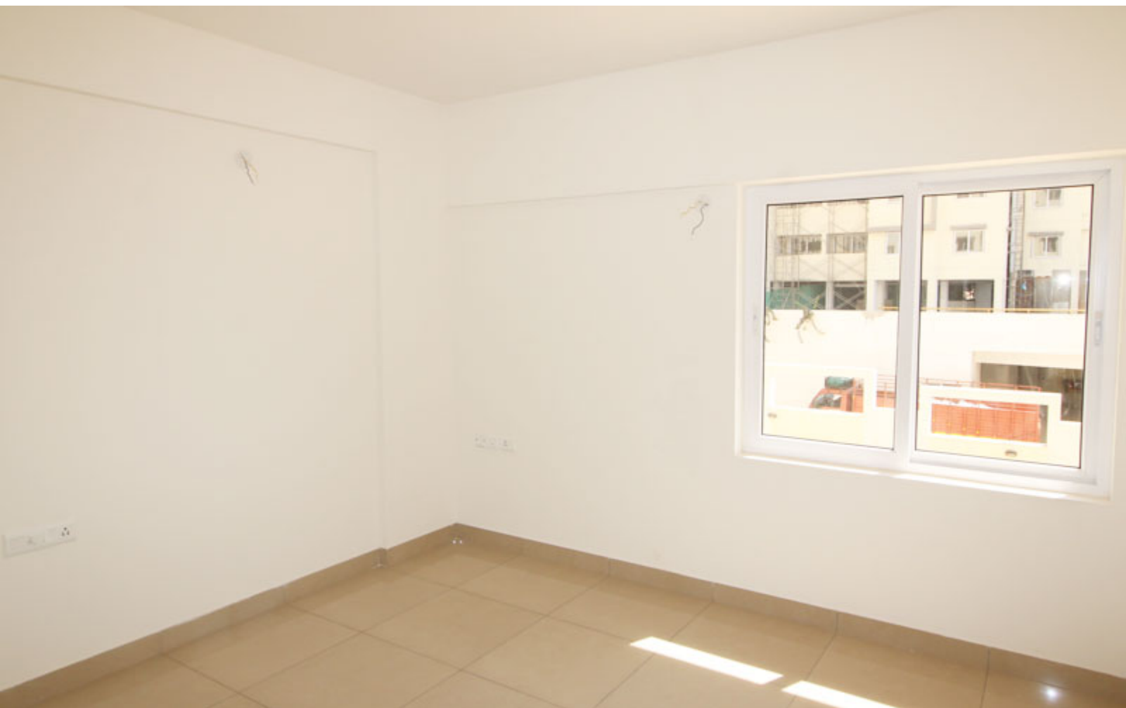
Internal Painting, Plumbing, Electrical work in progress