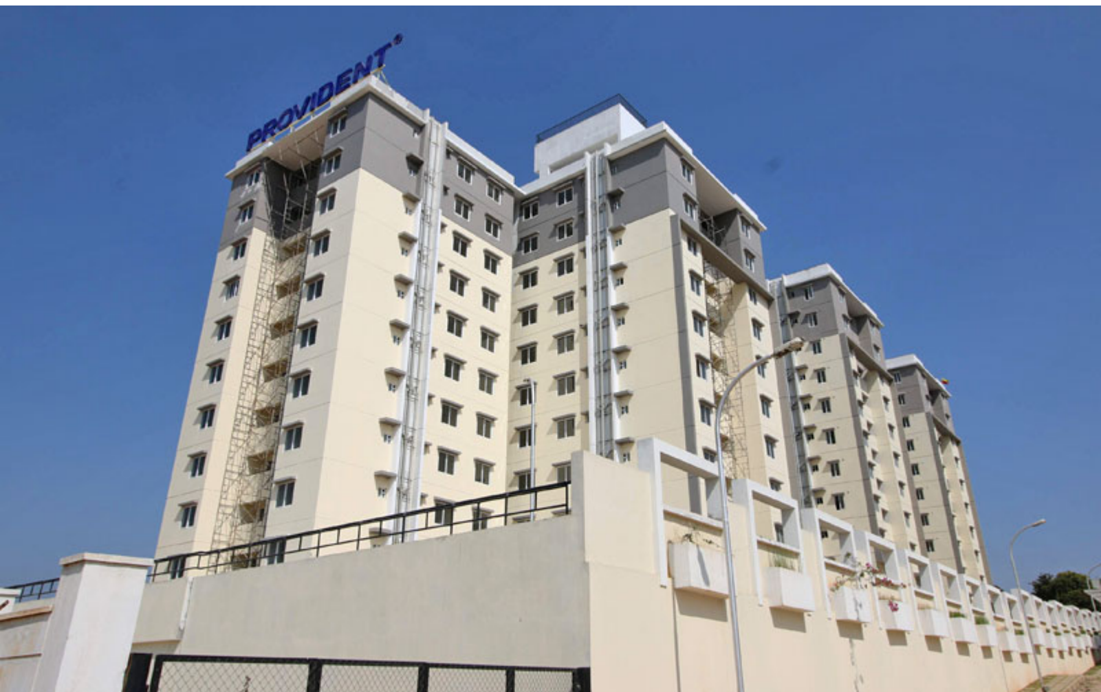
Building 1 overall view