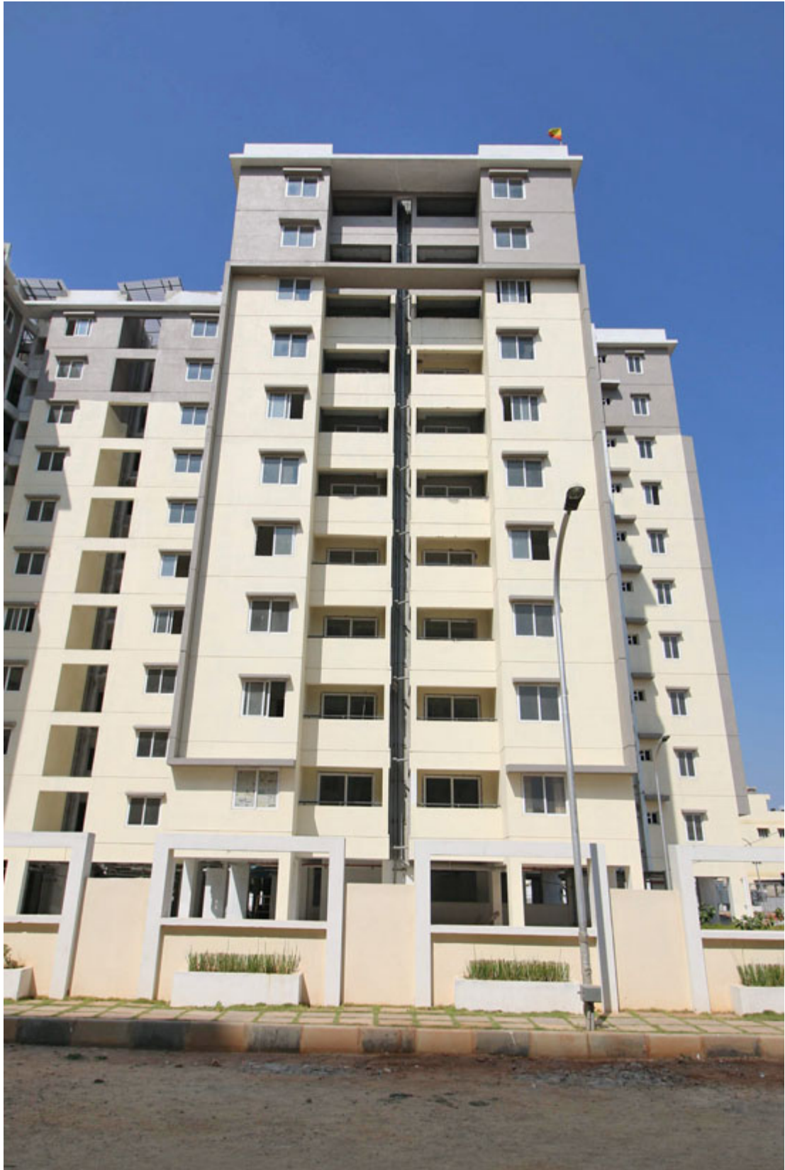
Building 1A - Internal Painting, Plumbing, Electrical work in progress