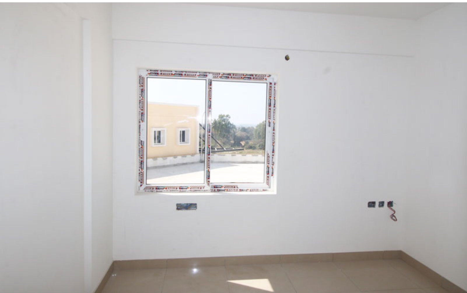
Internal Painting, Plumbing, Electrical work in progress