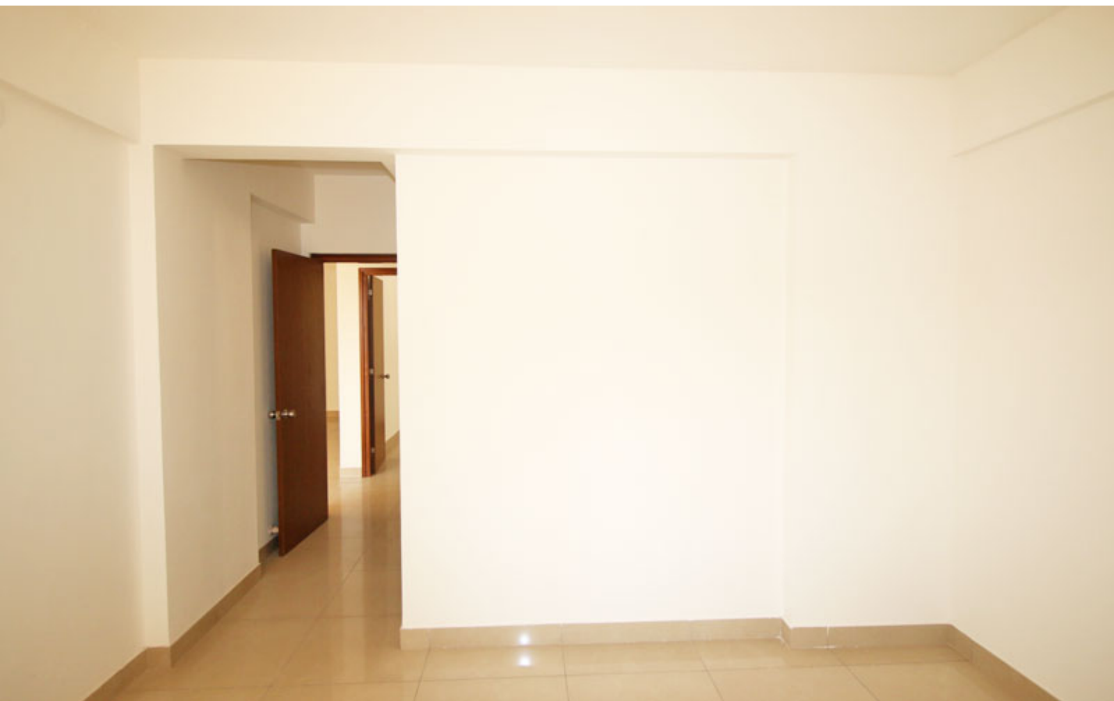
Internal Painting, Plumbing, Electrical work in progress