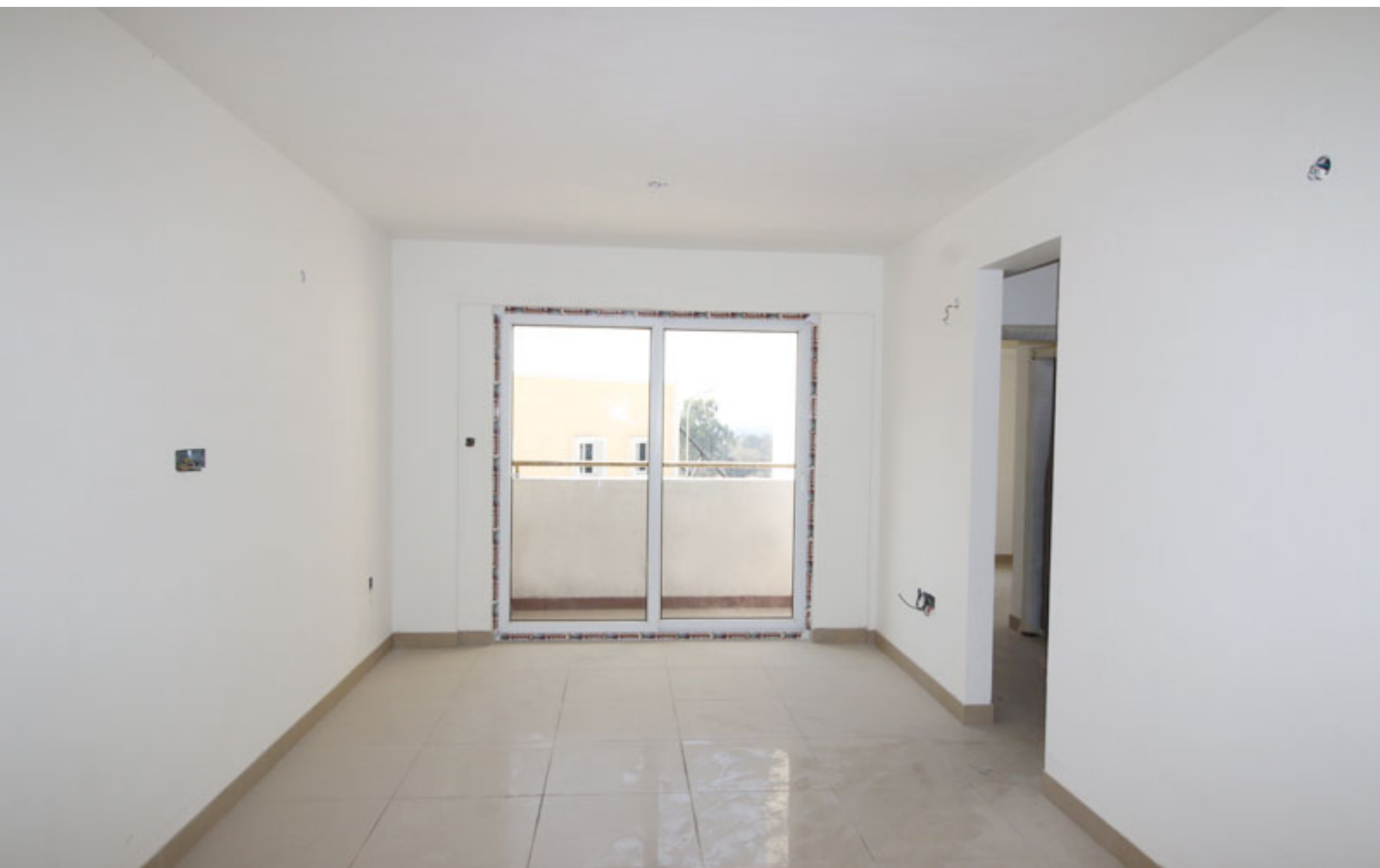
Internal Painting, Plumbing, Electrical work in progress