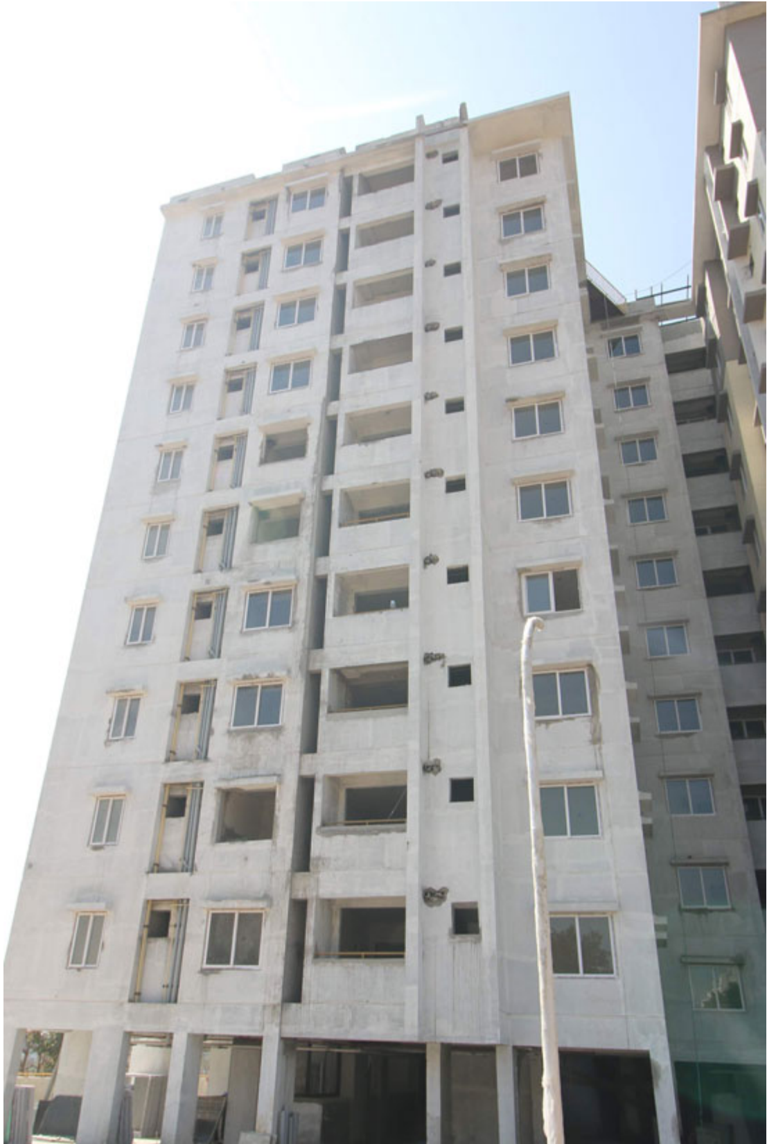
Building 2D - Internal Painting, Plumbing, Electrical work in progress