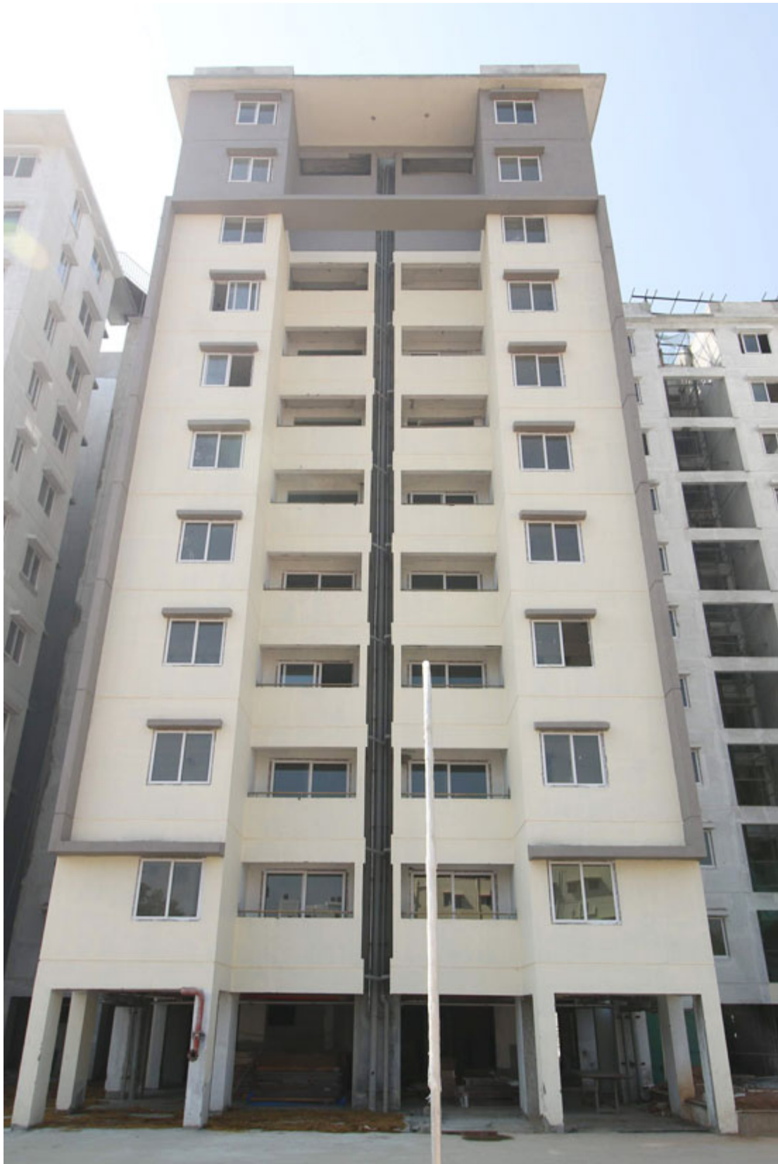
Building 2C - Internal Painting, Plumbing, Electrical work in progress