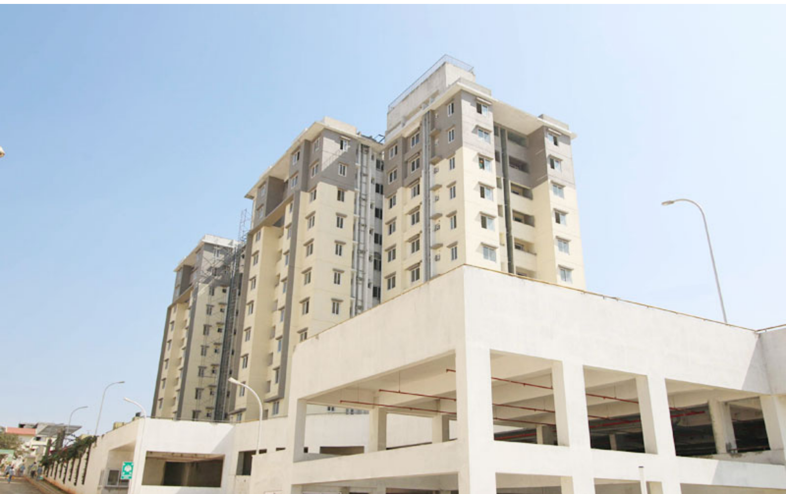
Building 2 overall view