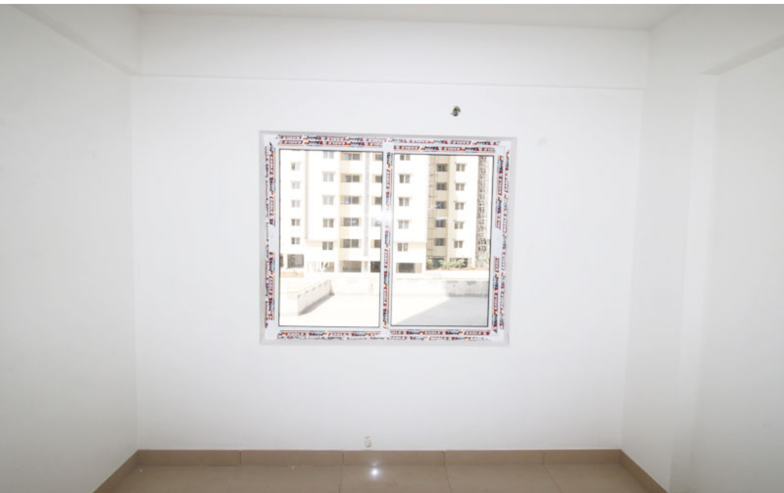
Internal Painting, Plumbing, Electrical work in progress