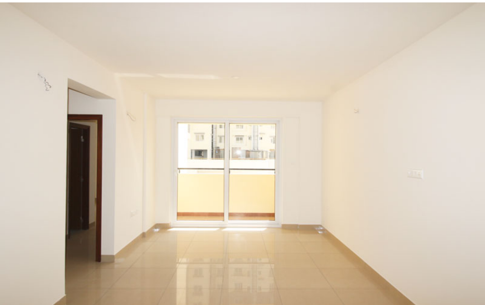
Internal Painting, Plumbing, Electrical work in progress