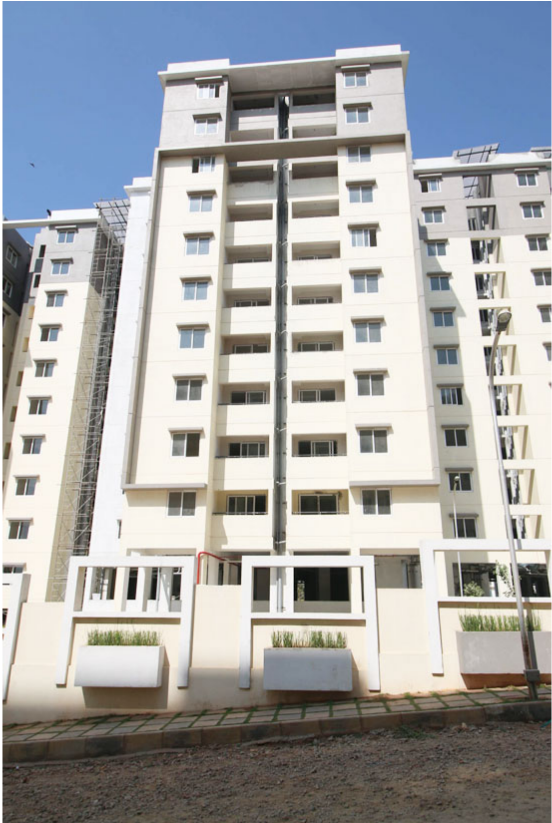
Building 1B - Internal Painting, Plumbing, Electrical work in progress