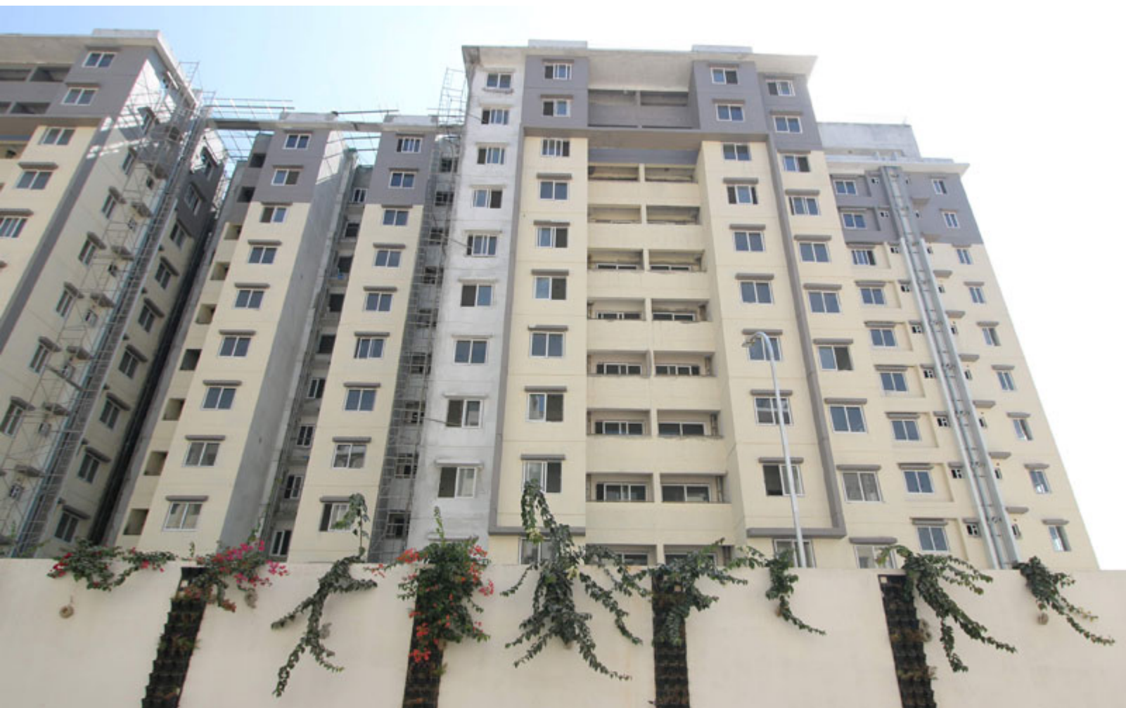
Building 2A - Internal Painting, Plumbing, Electrical work in progress