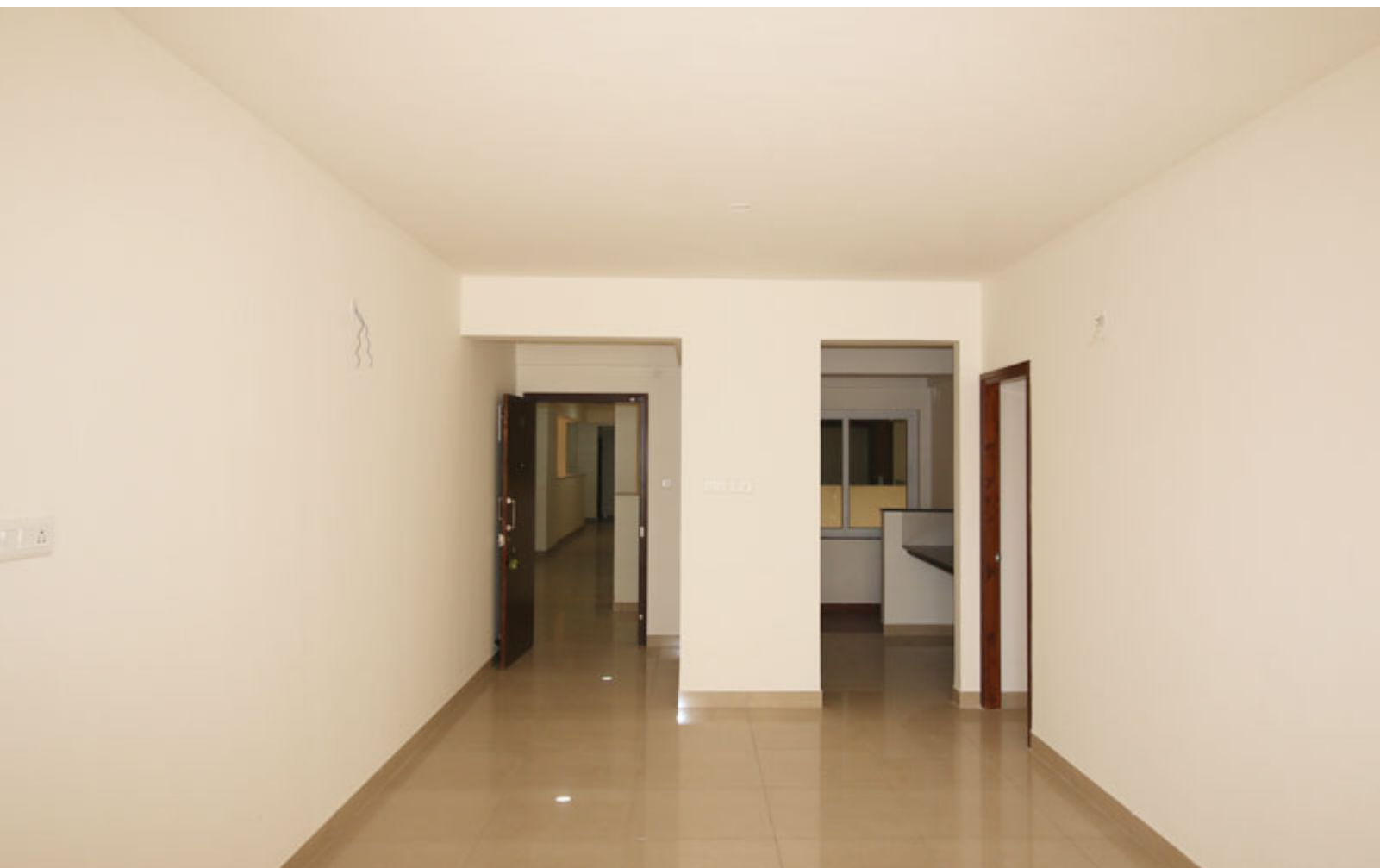
Internal Painting, Plumbing, Electrical work in progress