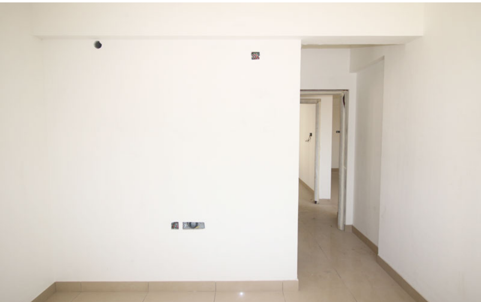
Internal Painting, Plumbing, Electrical work in progress